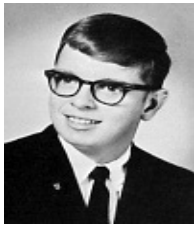
ERNEST W CURTIS