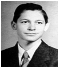
Deceased 2015-08-18 Age 88 Crossville TN