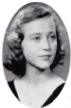
Deceased 2013-03-09 Age 93 Nashville TN