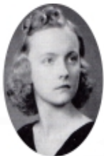
Deceased 2004-01-04 Age 82 Nashville TN