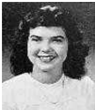
Deceased 2020-10--05 Age 89 Goodlettsville TN