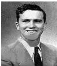
Deceased 2011-11-06 Age 81 Tarpon Springs FL