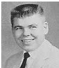
Deceased 2015-01-13 Age 77 Nashville TN

1512 Fox St Bossier City LA 71112-3704 (318) 747-1734