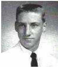
Deceased 2019-03-16 Age 77 Savannah GA