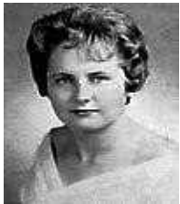
FRANCES LYNETTE WARREN HOUSE