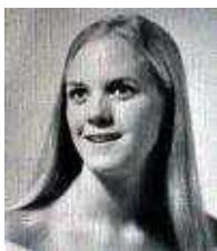
SALLY MARSHALL HIGH