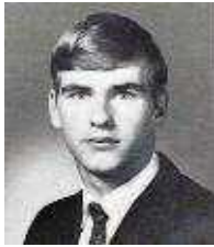
RONNIE LEE McDOWELL